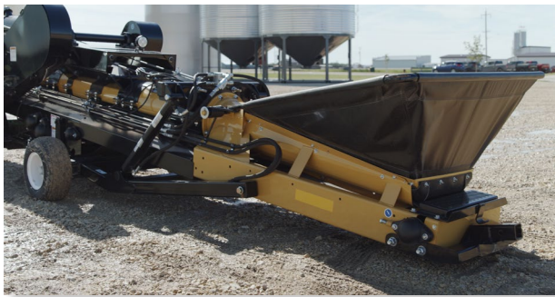
COOL FEATURE X